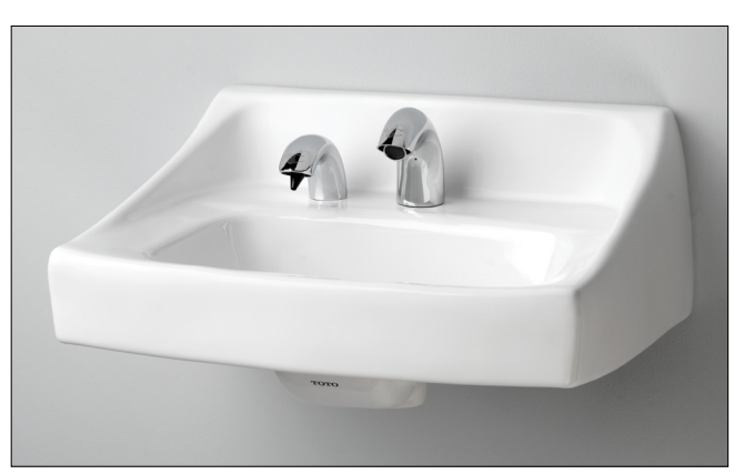
Faucet and Soap Dispenser sold separately