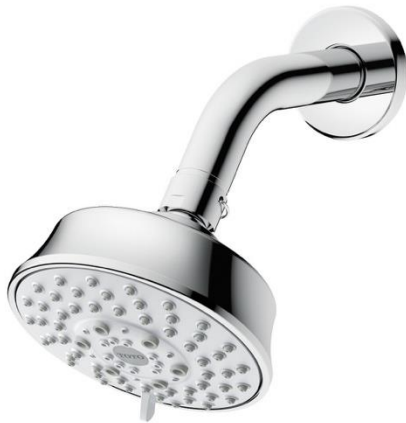
TOTO's new classic design overhead shower offers five spray patterns.

TOTO introduces a showering experience as relaxing as a soaking in warm bath. This is the power of the Warm Spa. A single voluminous pillar of warm water flows silently from TOTO's overhead rainshower or handshower, enveloping the body's curves in relaxing warmth, without heat loss or splash. With Warm Spa, TOTO presents a completely new showering experience that warms the body thoroughly without wasting water.